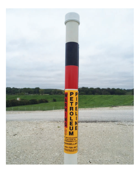
Our pipeline markers can be typically identified by the black and red bands at the top.

Magellan Midstream Partners, L.P., a wholly owned subsidiary of ONEOK, Inc., is principally engaged in the transportation, storage and distribution of refined products and crude oil. Magellan operates a 9,800 mile refined products pipeline system with 54 connected terminals and two marine terminals (one of which is owned through joint venture) and a 2,200 mile crude oil pipeline system.